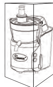
SHIPPING BOX W: 390 mm / 15.4" D: 660 mm / 26" H: 600 mm / 23.6"