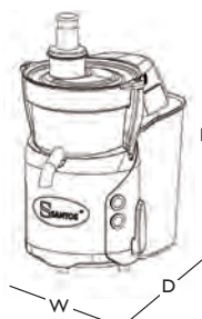
APPLIANCE W: 330 mm / 13" D: 562 mm / 22" H: 606 mm / 24"

Net: 25Kg (55 lbs) Shipping: 28 Kg (62 lbs)